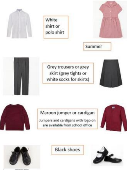
West Park Primary School Uniform